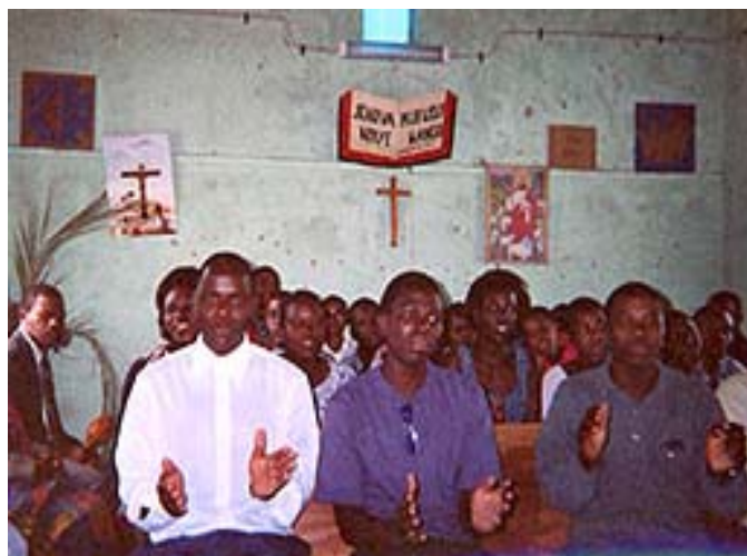
-- Sanganai Deaf Club, Zimbabwe